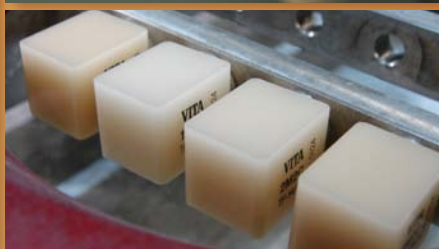
Device & method to hold multiple ceramic blocks & milling toolpath are U.S. & Int'l patents pending