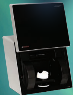
ORIGIN 3Shape Scanner