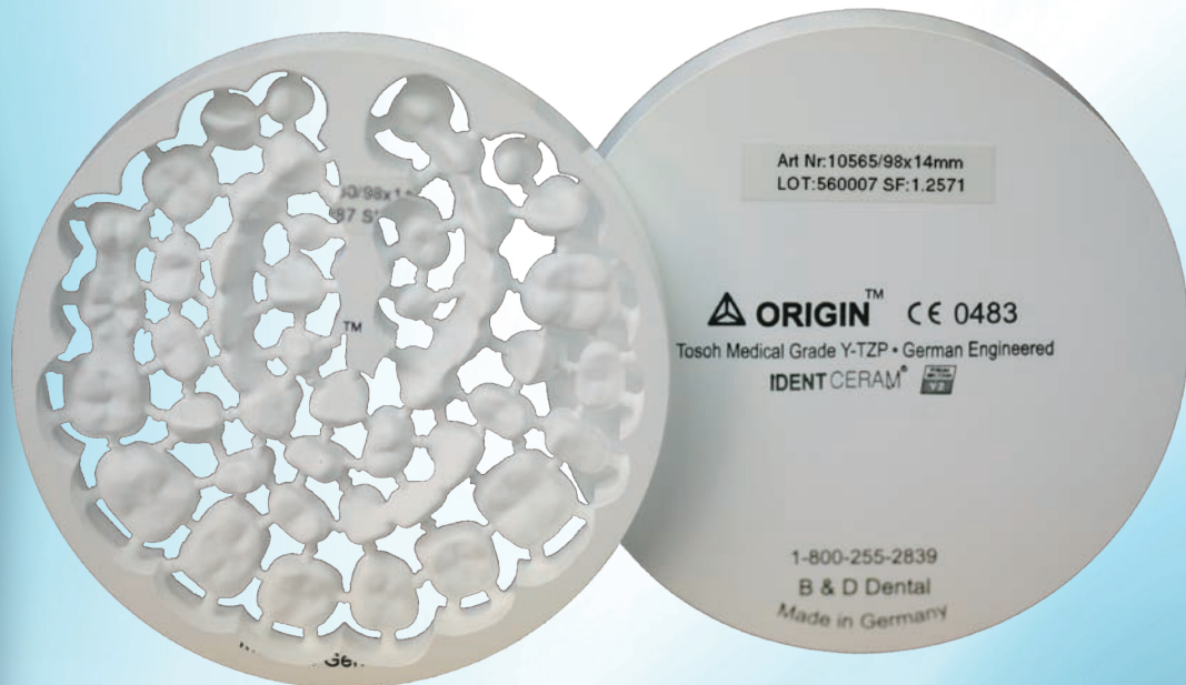
98mm disc, 47 actual copings (11 minute per coping average mill time)