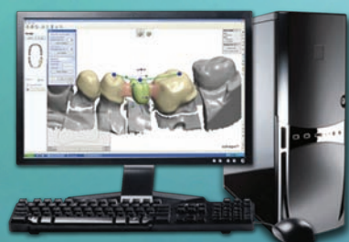
ORIGIN 3Shape Design Software