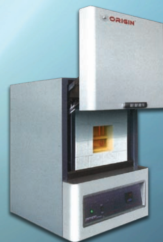
ORIGIN Programmable Sintering Oven