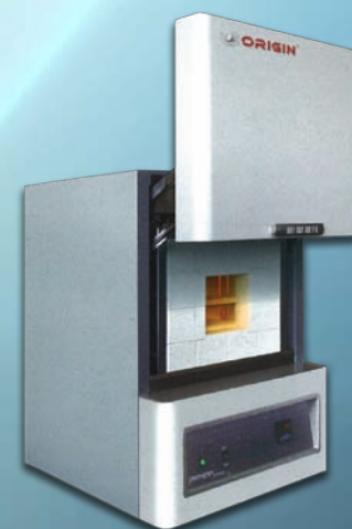
ORIGIN Programmable Sintering Oven