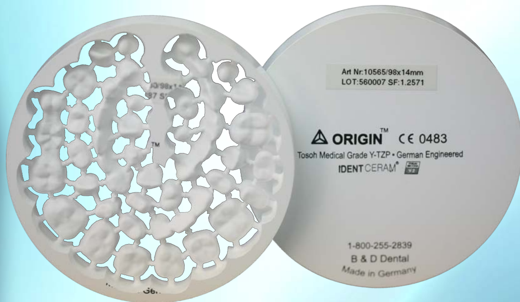
98mm disc, 47 actual copings (11 minute per coping average mill time)