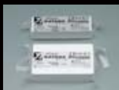
9 pre-colored Zirconia Blocks