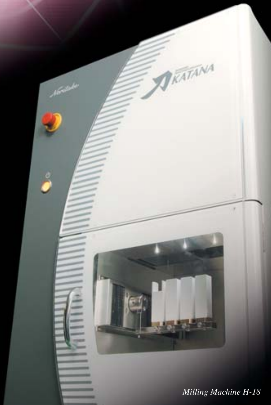
Milling Machine H-18